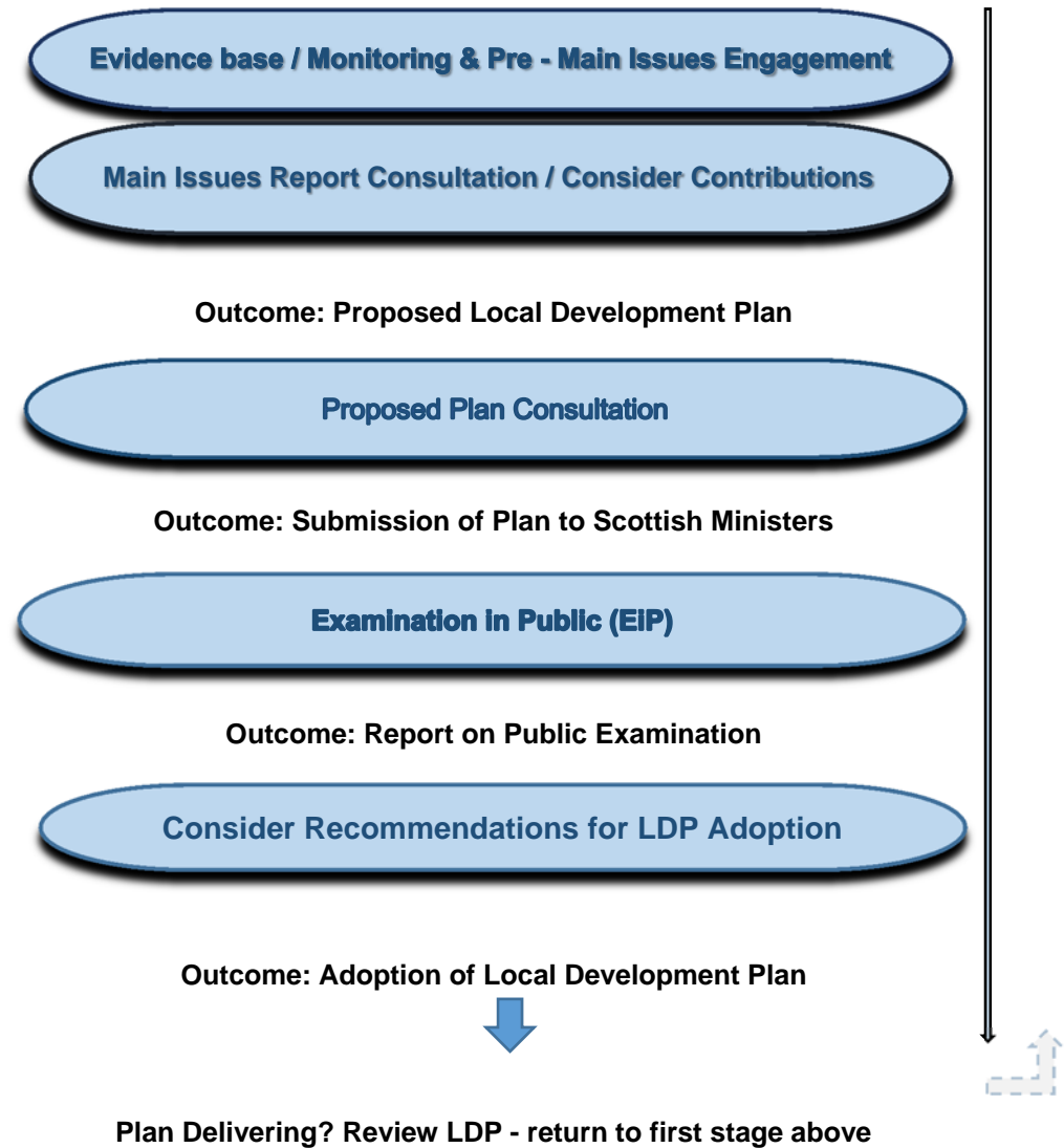
Figure 2 - LDP Stages: Activity (and Outcomes)